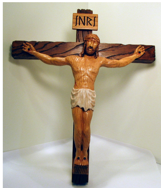
This Crucifix carved from our former communion rail will be dedicated at the Anniversary Service.